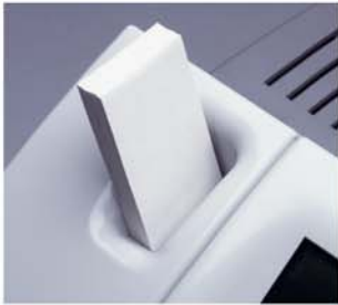
Automatic label dispenser