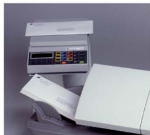
Optional 3kg or 5kg scale interface