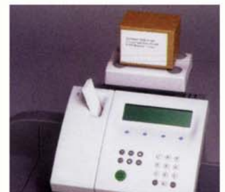
Integrated weigh platform